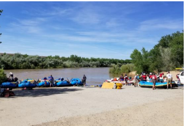
Upper Photo – Tibble Fork Reservoir Lower Photo – San Juan River Sand Island Launch